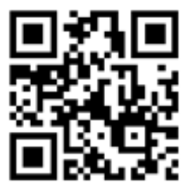
Fideo Tric a Chlic