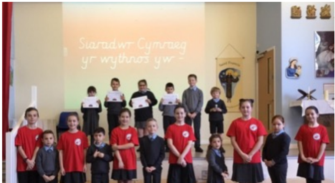
The school's Cyngor Cymraeg leading a service

In 2015 and 2016, the school won a 'Shwmae' award as recognition of the hard work and commitment to raising the profile of Welsh in their school. In January 2016, the school was asked to pilot a Language Charter for the ERW consortium. Since then, the school was awarded the bronze and silver award. Members of the Council have played a leading role in this work by leading on the completion of targets and gathering appropriate evidence by going on learning trips and giving teachers feedback on their findings.