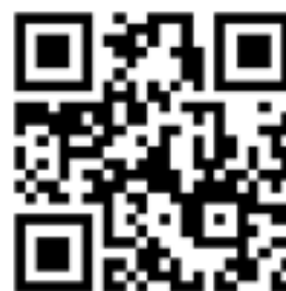
Fideo Darllen Tîm CA2