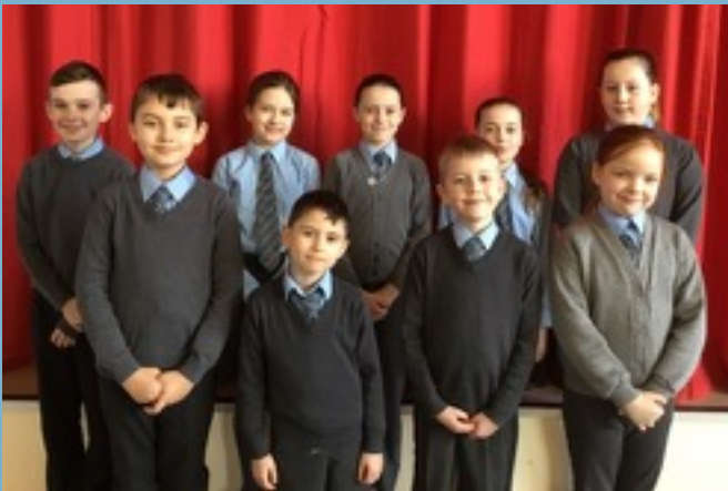
Y Cyngor Cymraeg