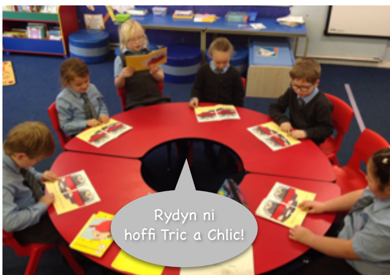
The school has been piloting the Tric and Chlic scheme for English-medium schools.

The consensus of staff is that almost all pupils have made strong progress in developing their reading skills. Pupils in the Foundation Phase and the KS2 project have achieved success in a short period and we believe that pupils will develop further in continuing with both projects.