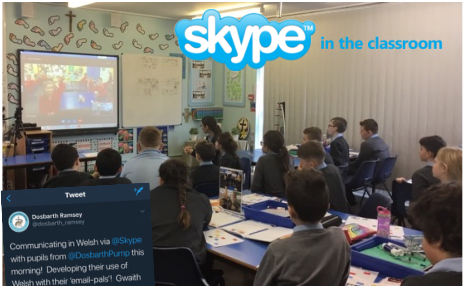
Pupils enjoy talking to pupils of at Holy Name School

As part of the project, St Francis School has begun to make effective use of Skype in class to provide opportunities for pupils to speak Welsh with classes in schools across the county and beyond.